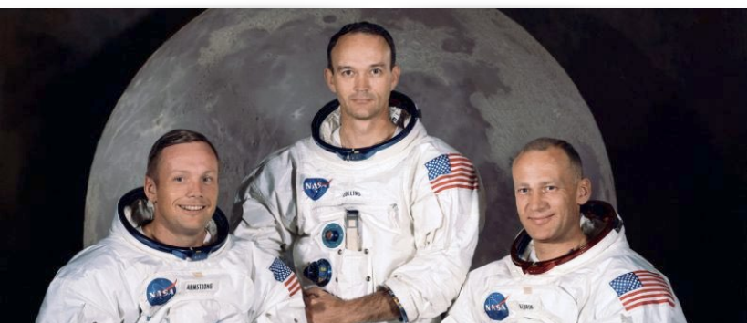
The 3 astronauts of the Apollo 11 mission Neil Armstrong - Michael Collins - Buzz Aldrin